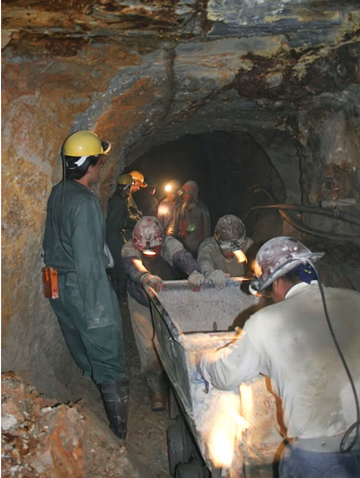
Coal miners.

(S.617) proposes extending the higher tax rate through 2019, beginning the first day of the first month beginning after the date of enactment. This provision would need to be changed to extend the higher rate through 2020 or apply the extension retroactively to have any effect.