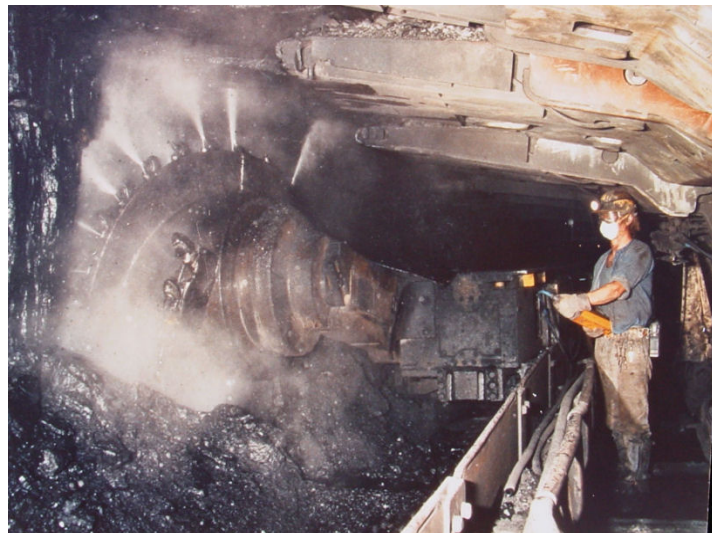
A coal longwall shearer.

Several pieces of legislation in the 116th Congress propose extending the tax that funds the Black Lung Disability Trust Fund at 2018 levels. In June, the House Ways and Means Committee passed the Taxpayer Certainty and Disaster Tax Relief Act of 2019 (H.R. 3301), which would reinstate the increased rates on coal through December 31, 2020, beginning the first day of the first calendar month beginning after the date of enactment.