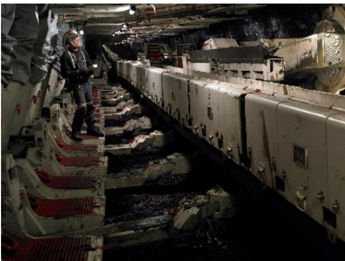
Colorado coal mine.